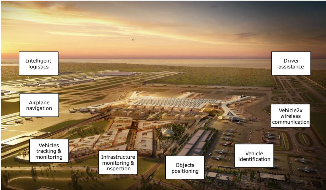
Cross-domain application of AIoT technologies - Example: Airport

InSecTT will open up new market opportunities for the European industry , will significantly reduce time to market and decrease costs for trustable AIoT solutions on the market, in particular by using new designs and technical building blocks. InSecTT will significantly impact the European Union to achieve the full potential of the “Artificial Intelligence of Things” . It will establish the EU as a center of intelligent, secure and trustworthy systems for industrial applications enabled by a strong industry with a strong reputation and an informed society, in order to enable products and services based on AI compliant to European values and “Made in Europe” .