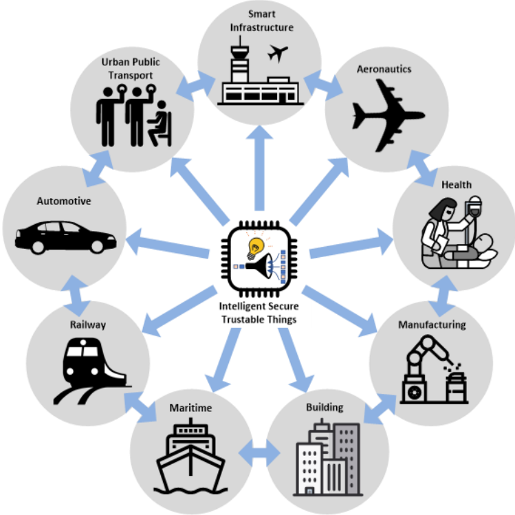
InSecTT – Providing re-usable solutions across domains

citizens up to European stakeholders. InSecTT will bring intelligent solutions into the market by conclusive showcases all over Europe, hence strengthening Europe’s industry and once more make European solutions a frontrunner in cutting-edge technology.